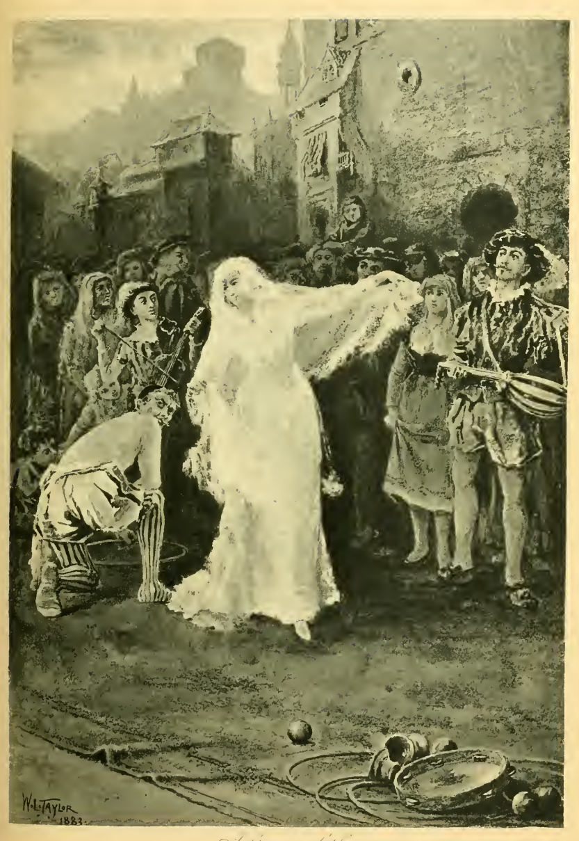
A figure lithe